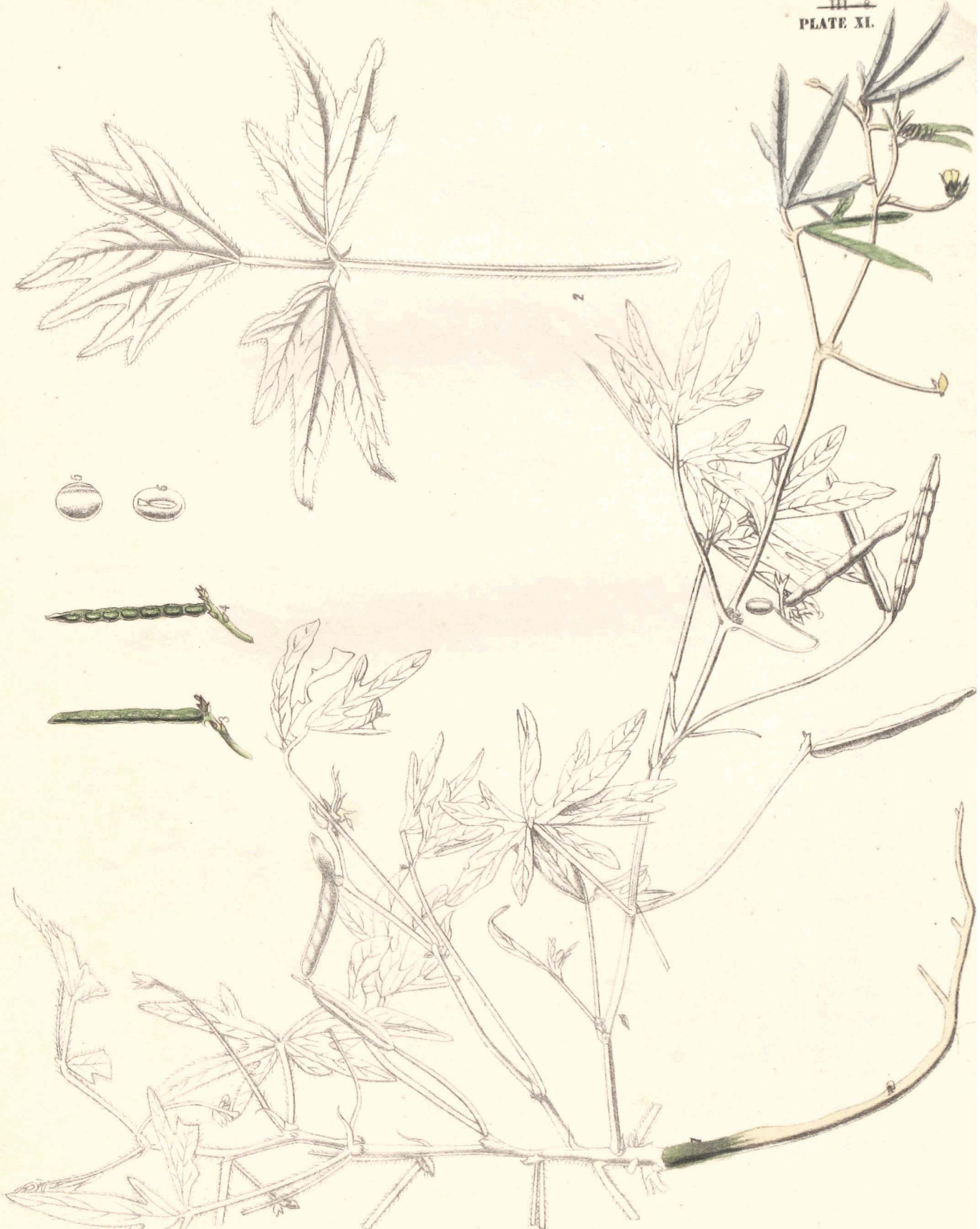
PHASEOLUS ACONITIFOLIUS, JACQ.