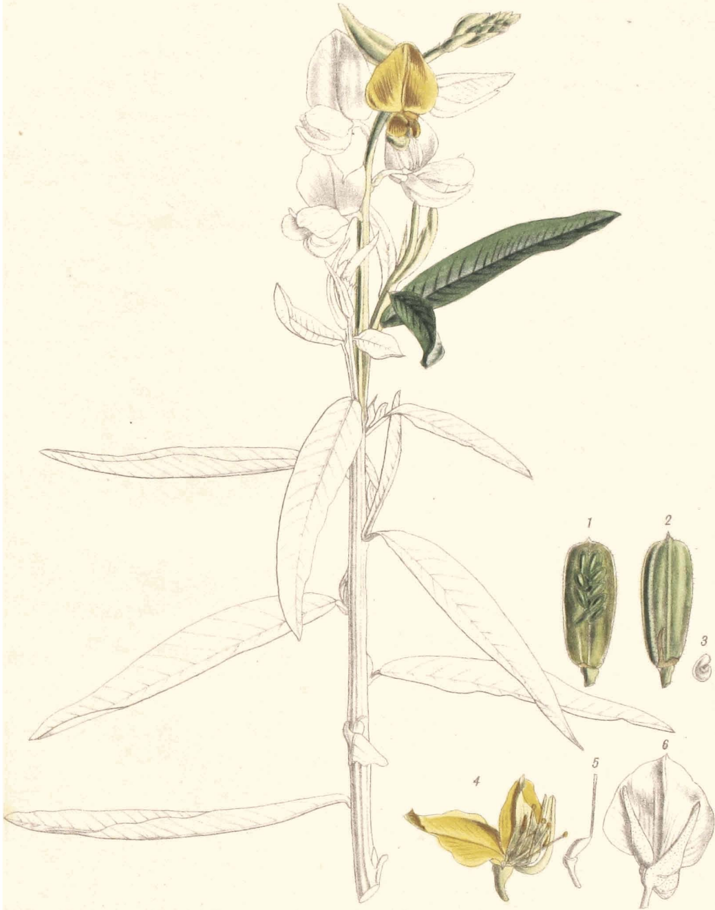
CROTALARIA JUNCEA, L.