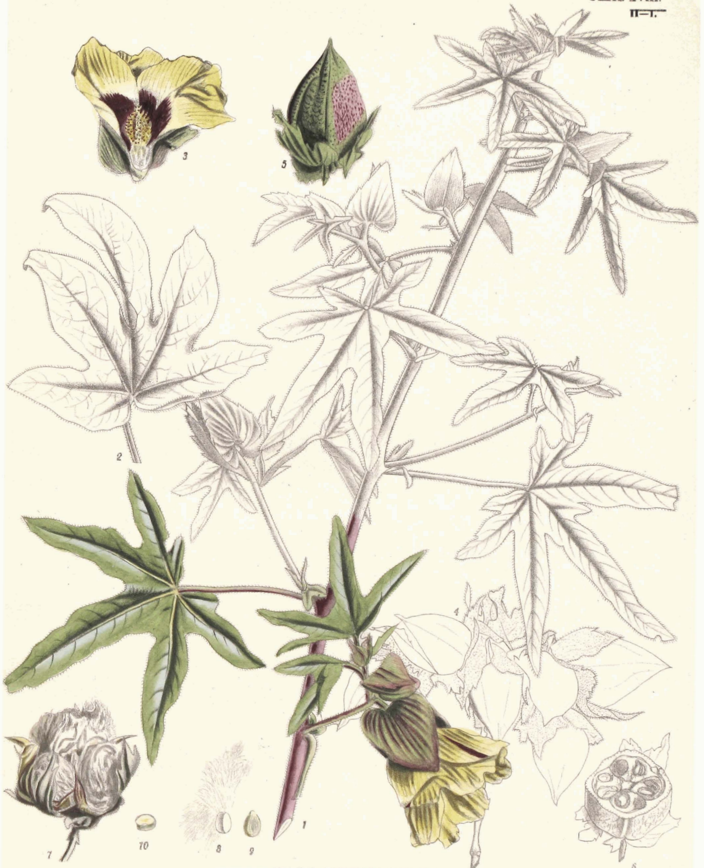
GOSSYPIUM HERBACEUM, L.