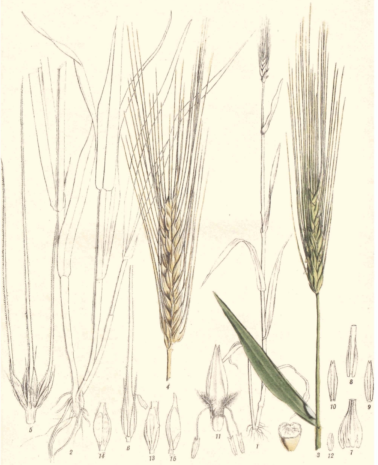
HORDEUM VULGARE, LINN.