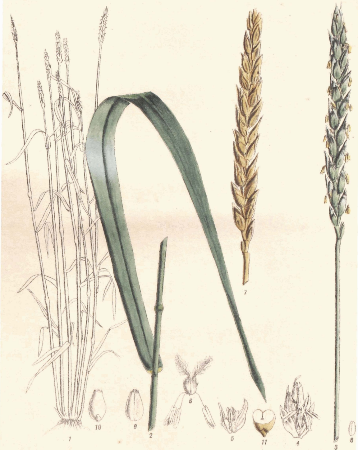
TRITICUM SATIVUM, L.A.M.