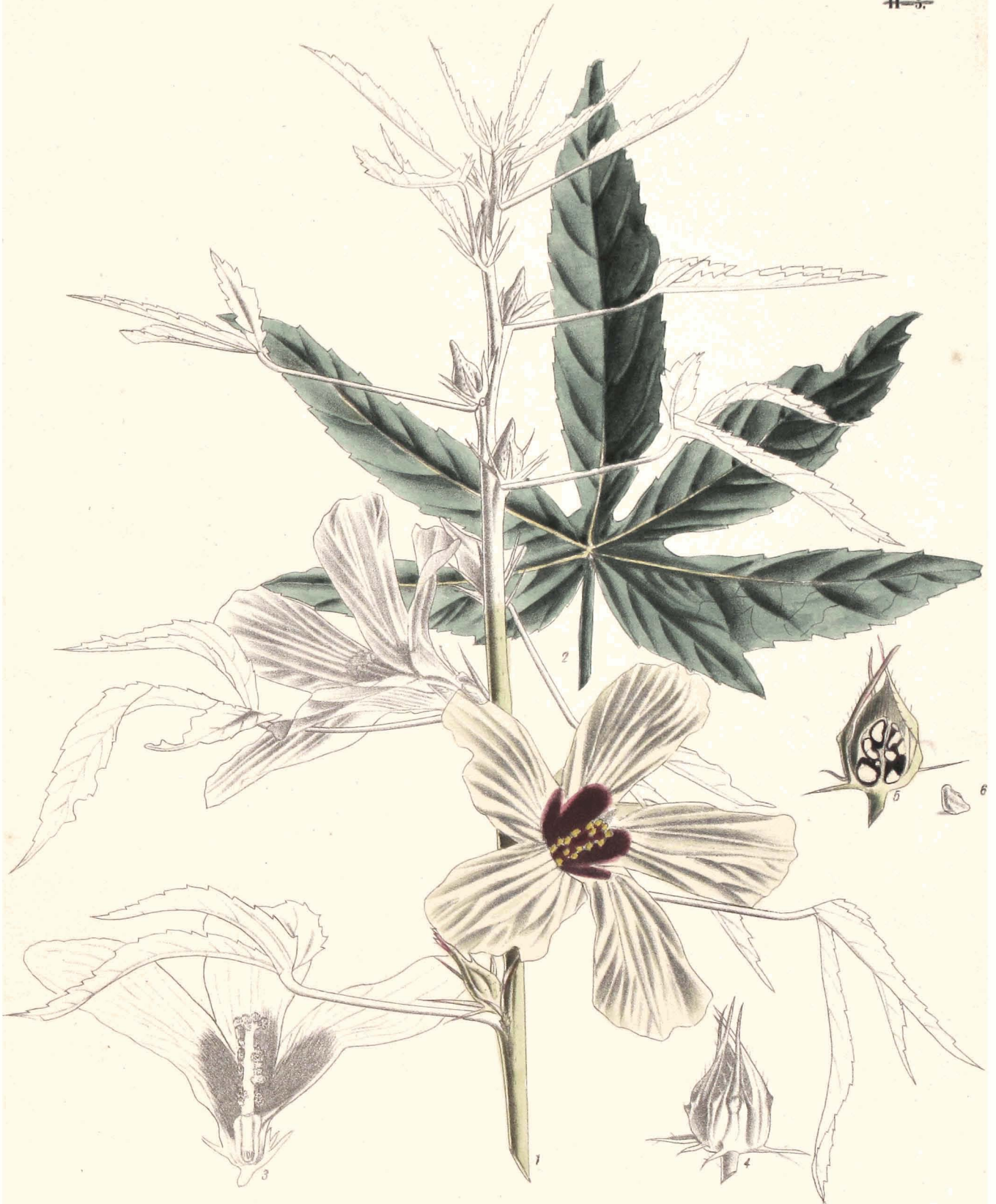
HIBISCUS CANNABINUS, L.