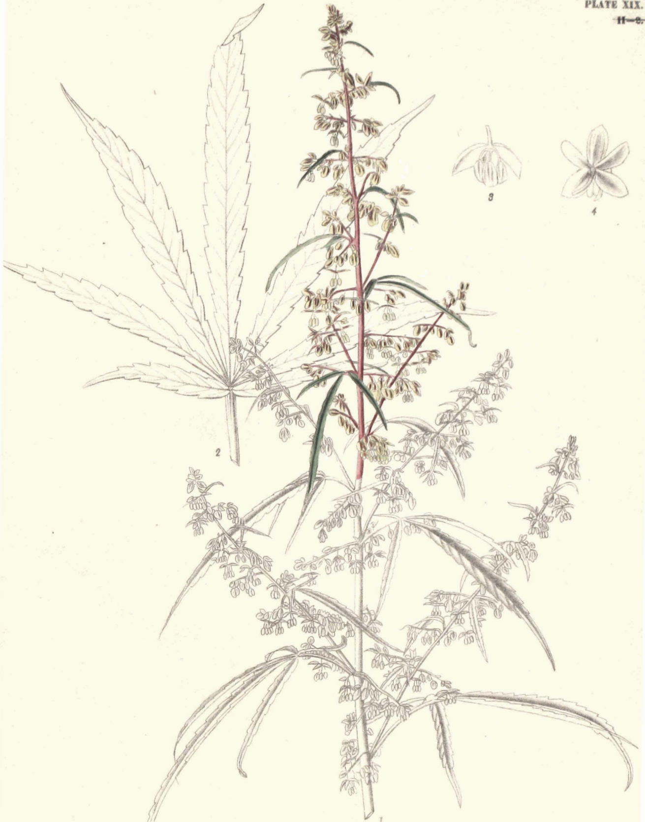
CANNABIS SATIVA, L., ♂