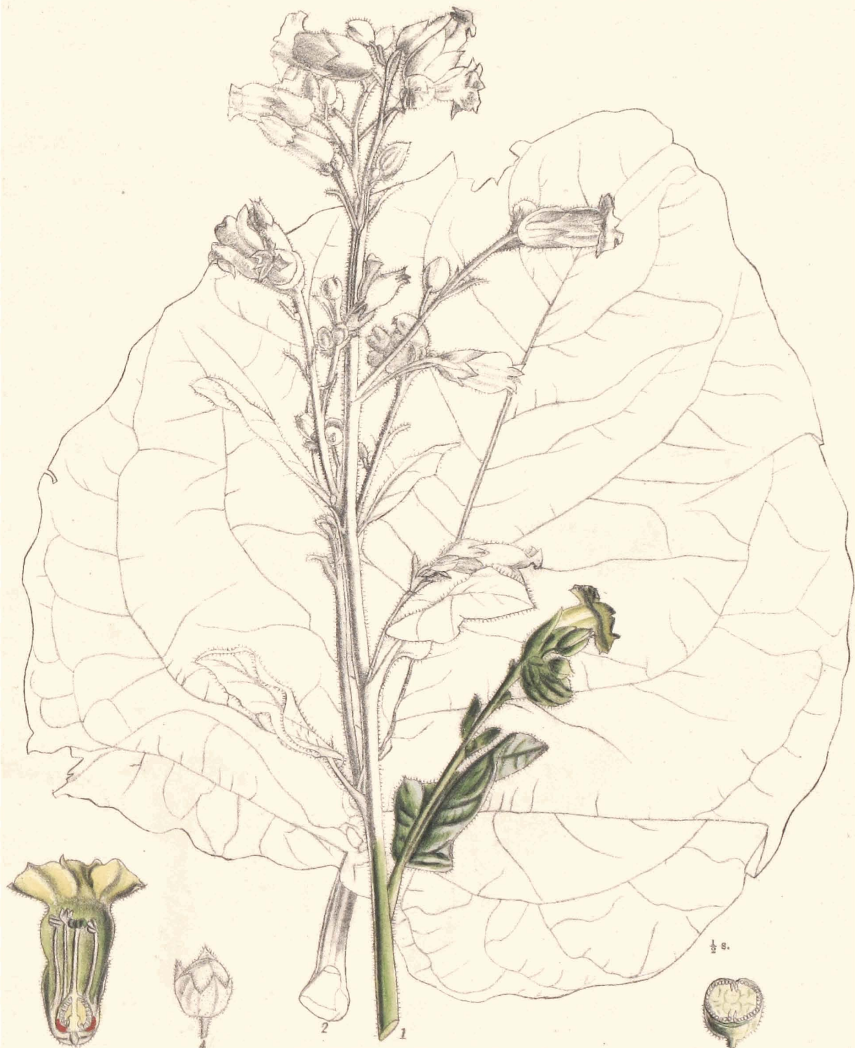
NICOTIANA RUSTICA, LINN.