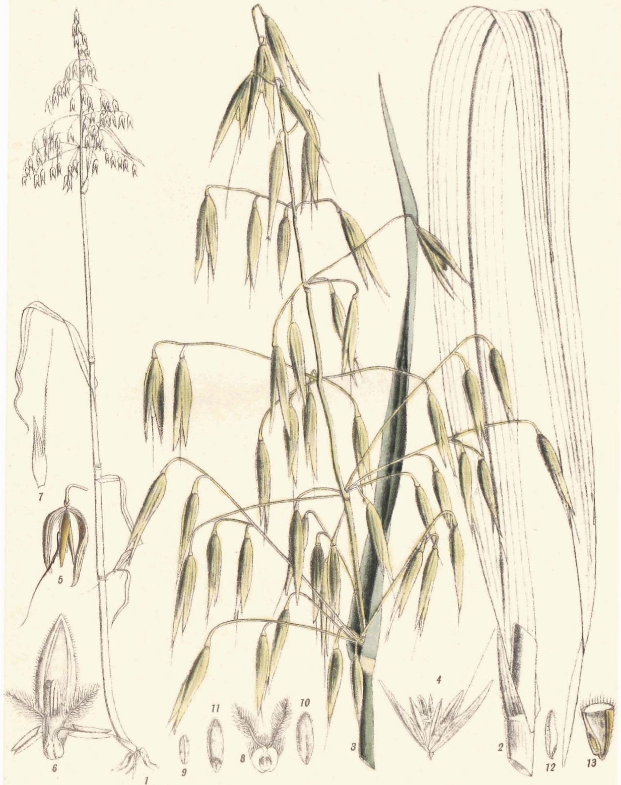
AVENA SATIVA, LINN.