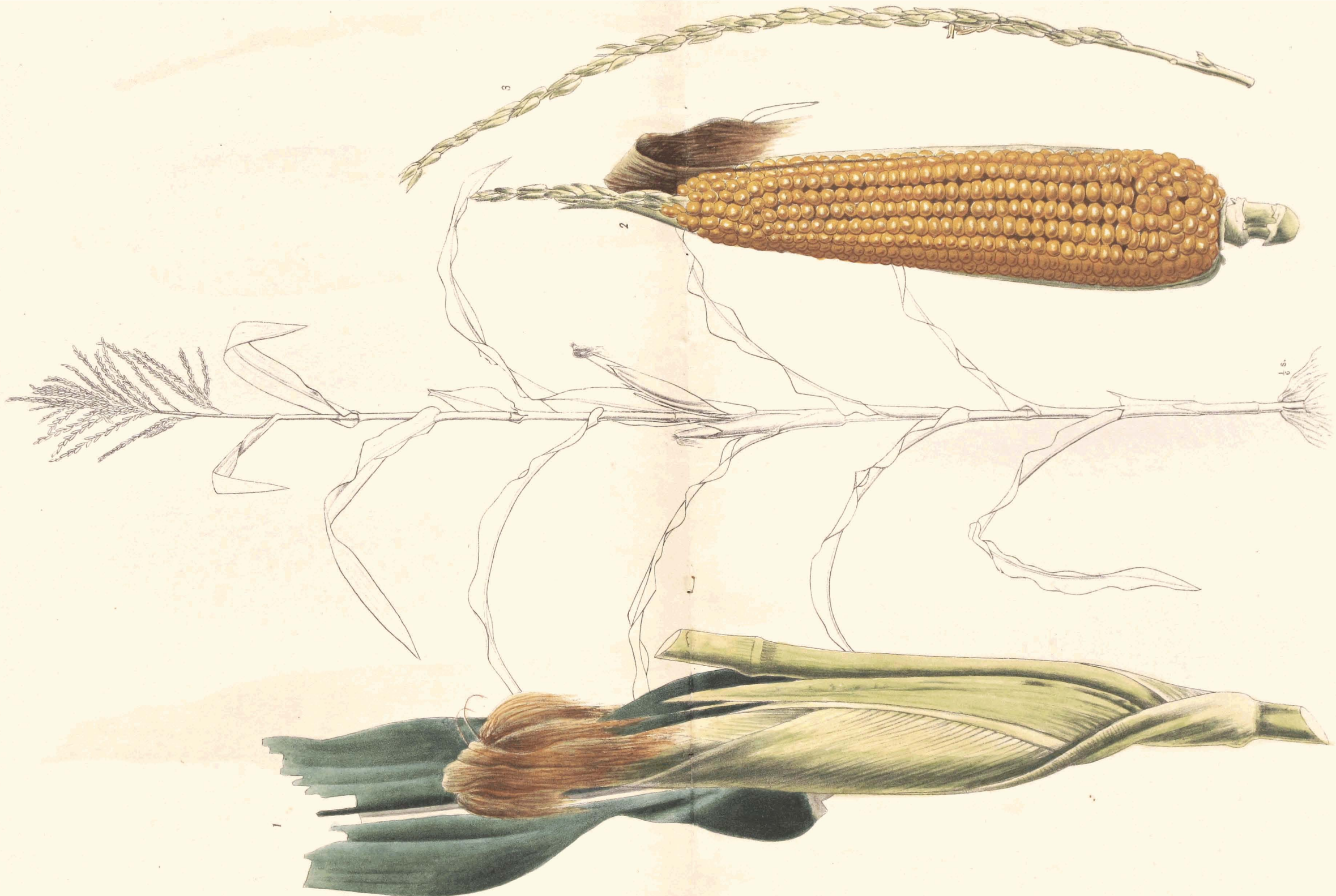
ZEA MAYS, L.