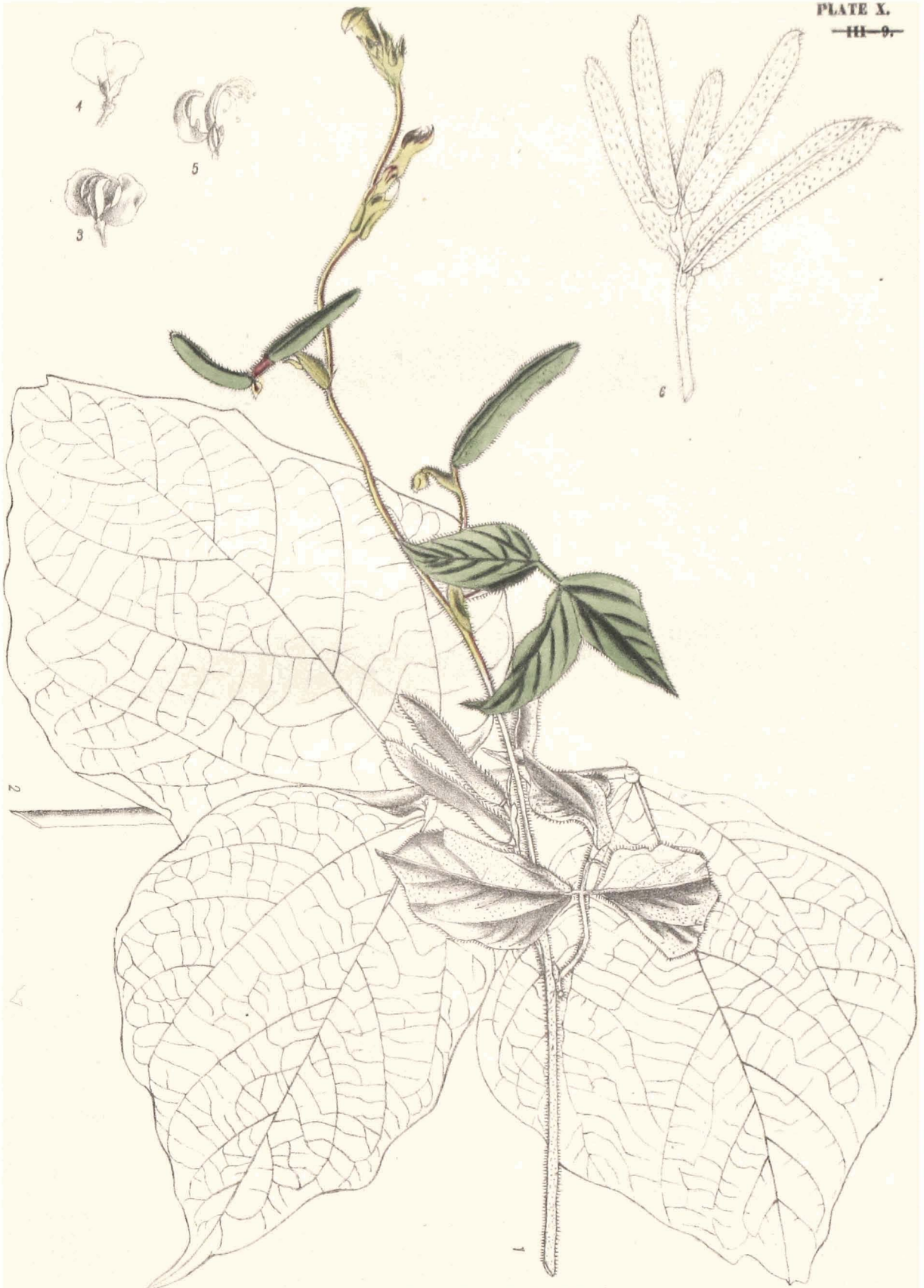
PHASEOLUS MUNGO, L. VAR. RADIATUS.