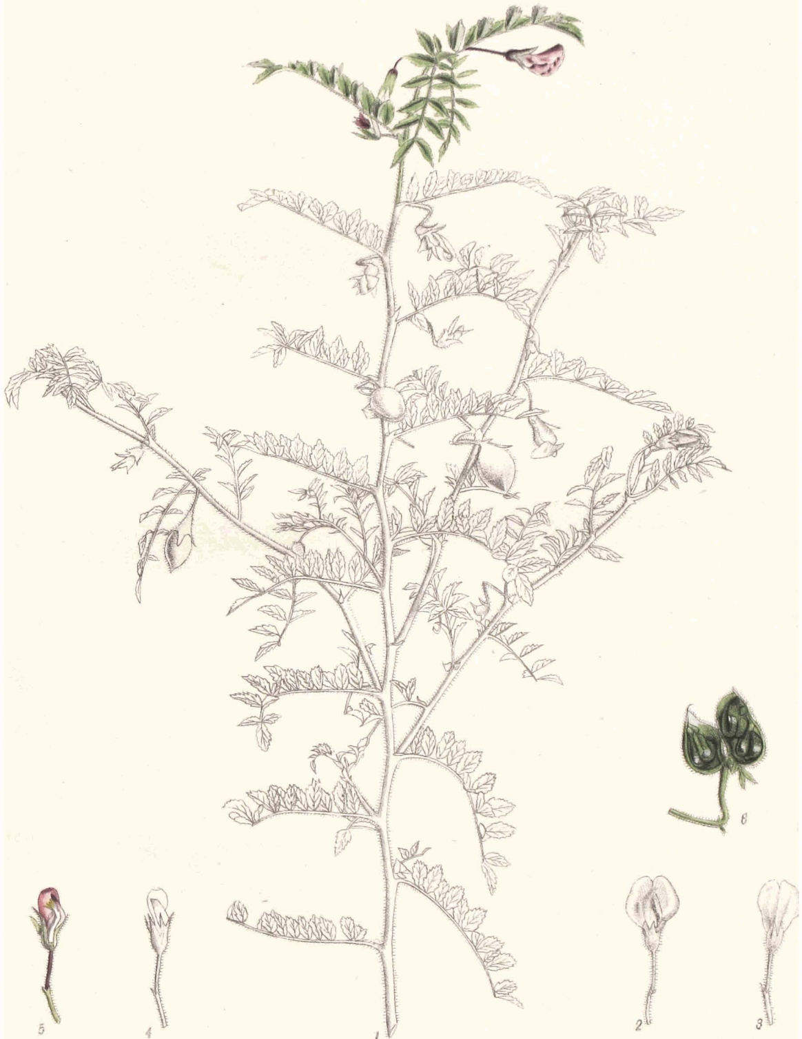
CICER ARIETINUM, L.