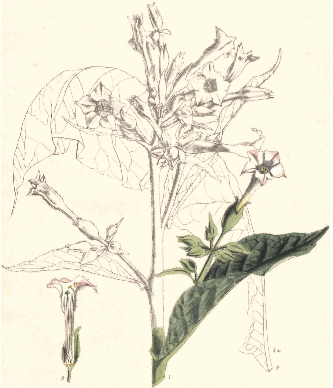
NICOTIANA TABACUM, LINN.