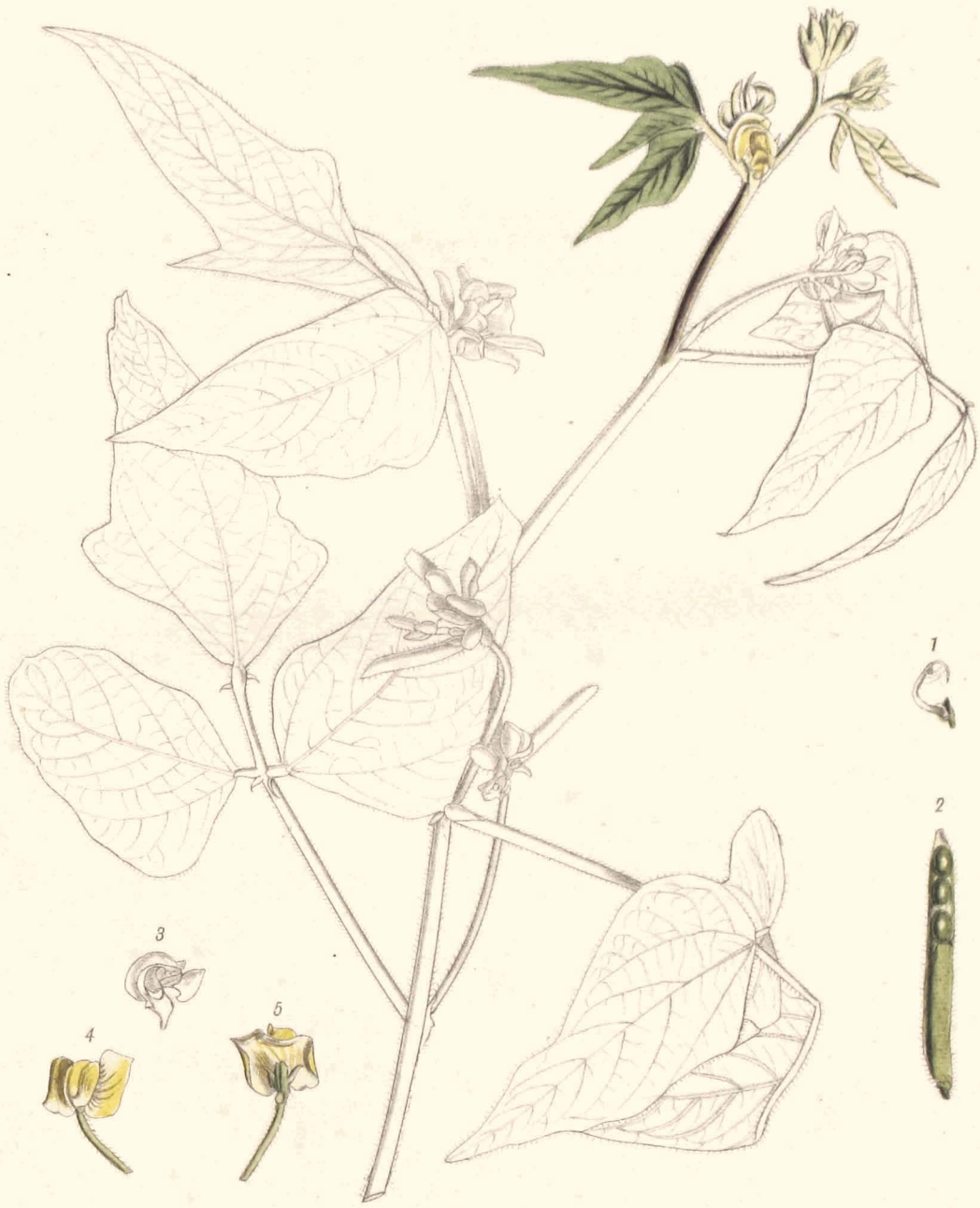
PHASEOLUS MUNGO, L.