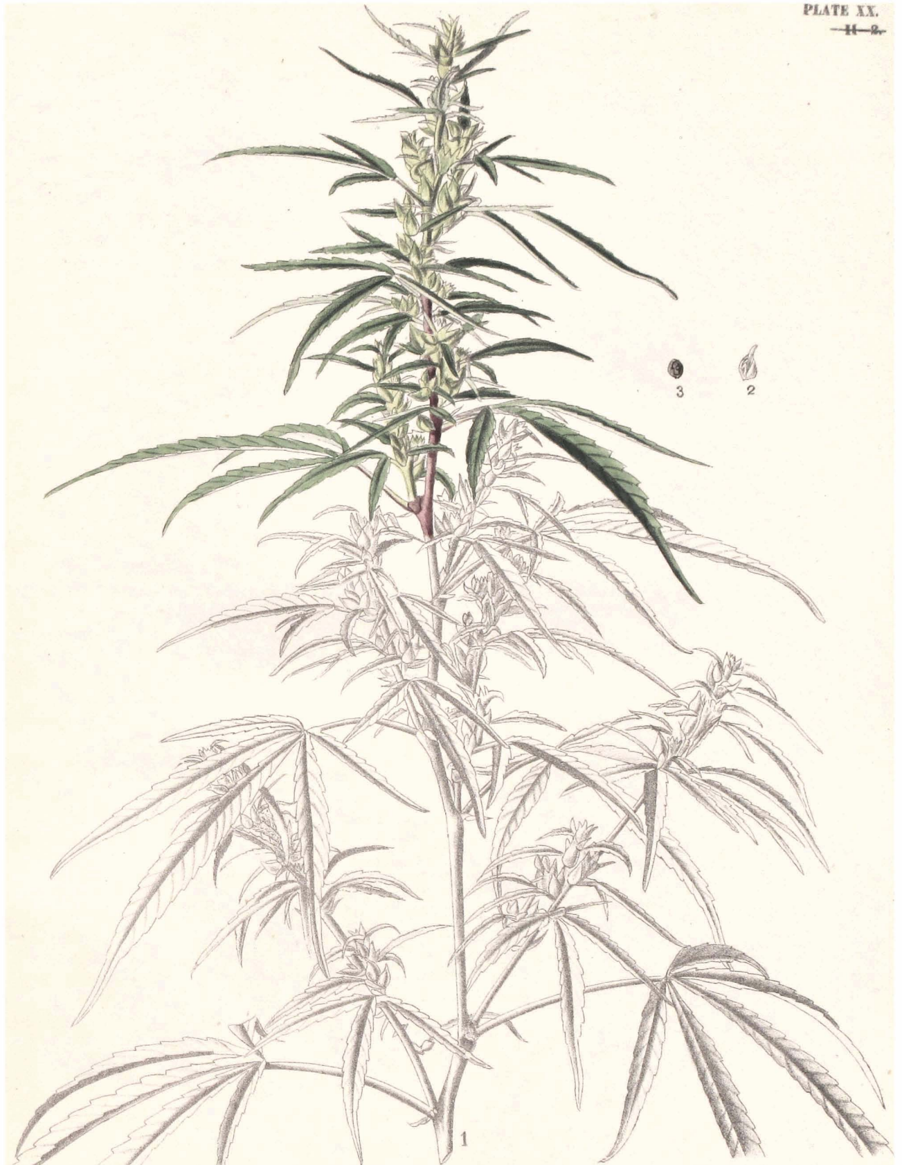
CANNABIS SATIVA, L., ♀